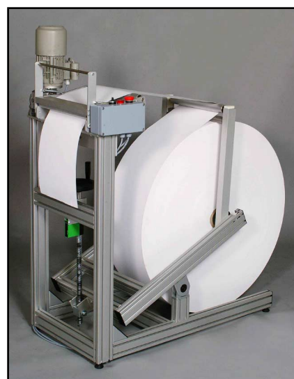
Paper Roll Feeder